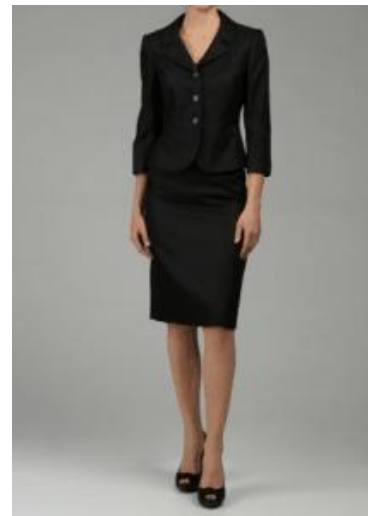
Black skirt suit