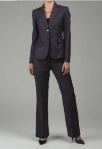
Dark navy pantsuit