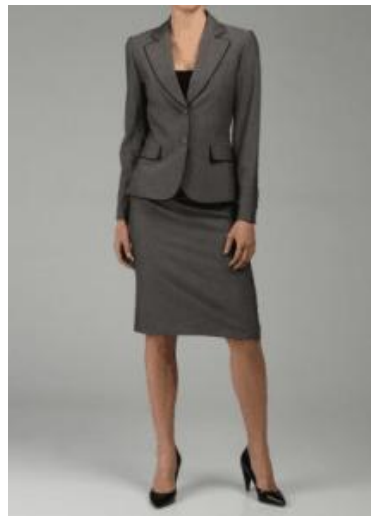
Grey skirt suit