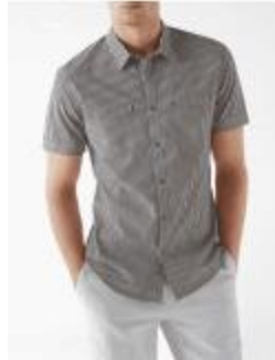
Short sleeve button down